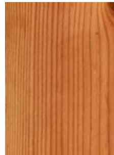
Douglas Fir (10 yr Warranty)