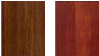
COFFEE STAIN CHERRY STAIN