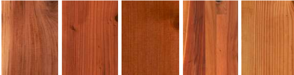
Redwood (15 yr Warranty)

Below are the 5 grades of wood we offer with the Transparent Premium Sealant applied. The color tones shown are close representations of the color your furniture will look like. There is no extra charge for the Transparent Premium Sealant: