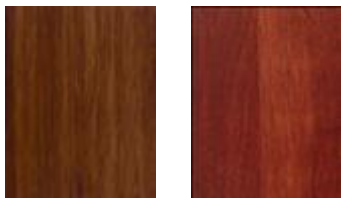
COFFEE STAIN CHERRY STAIN