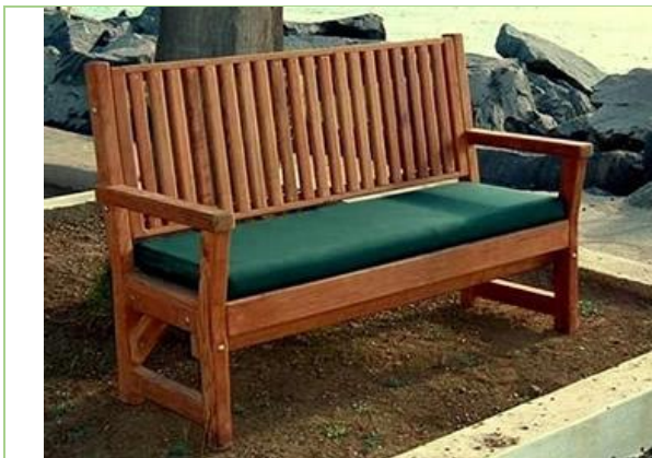
Massive Garden Bench with Cushion