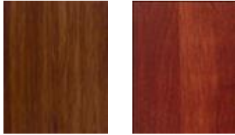
COFFEE STAIN CHERRY STAIN