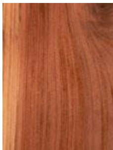
Redwood (15 yr Warranty)

Below are the 5 grades of wood we offer with the Transparent Premium Sealant applied. The color tones shown are close representations of the color your furniture will look like. There is no extra charge for the Transparent Premium Sealant: