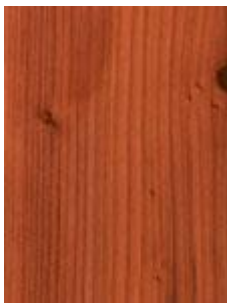
Mature Redwood (20 yr Warranty)