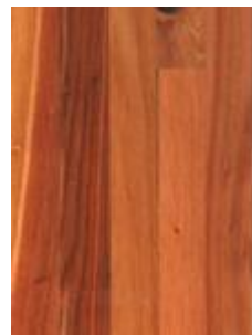
Mosaic Eco-Wood (10 yr Warranty)