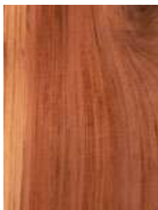
Redwood (15 yr Warranty)

Below are the 5 grades of wood we offer with the Transparent Premium Sealant applied. The color tones shown are close representations of the color your furniture will look like. There is no extra charge for the Transparent Premium Sealant: