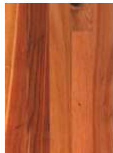
Mosaic Eco-Wood (10 yr Warranty)