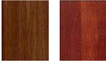
COFFEE STAIN CHERRY STAIN