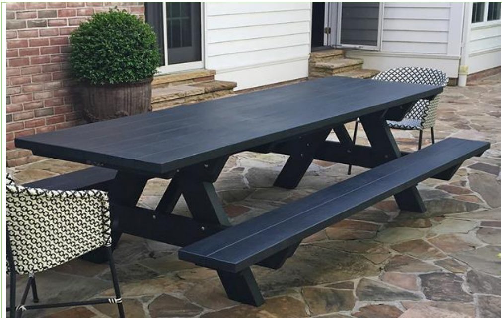
Benjamin Moore: Black Stain, 2131-10

Have Forever Redwood paint your order any color you like. We prefer to use Benjamin Moore paints because they make excellent quality products and offer a huge selection of paints and colors to choose from.