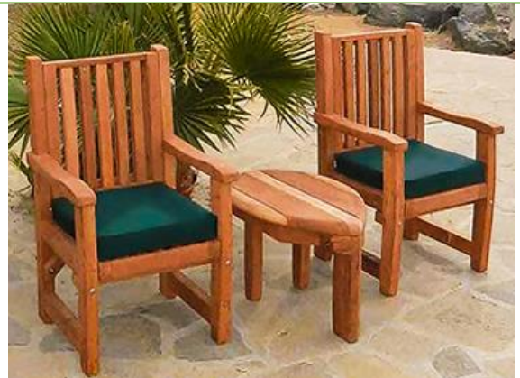
Ruth Armchairs with Cushions

The most popular fabric choice over the years is the Forest Green. For this reason, we've made it our default fabric choice for all cushions. If you'd like a cushion in a color or pattern other than Forest Green, you can choose from thousands of fabrics by visiting our Sunbrella fabric partner Trivantage Upholstery Fabric at: https://www.trivantage.com/fabric-upholstery .