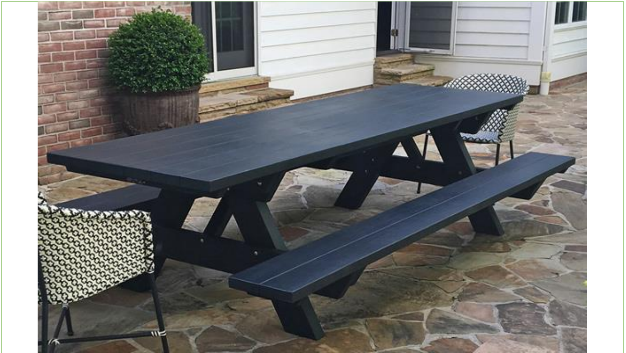
Benjamin Moore: Black Stain, 2131-10

Have Forever Redwood paint your order any color you like. We prefer to use Benjamin Moore paints because they make excellent quality products and offer a huge selection of paints and colors to choose from.