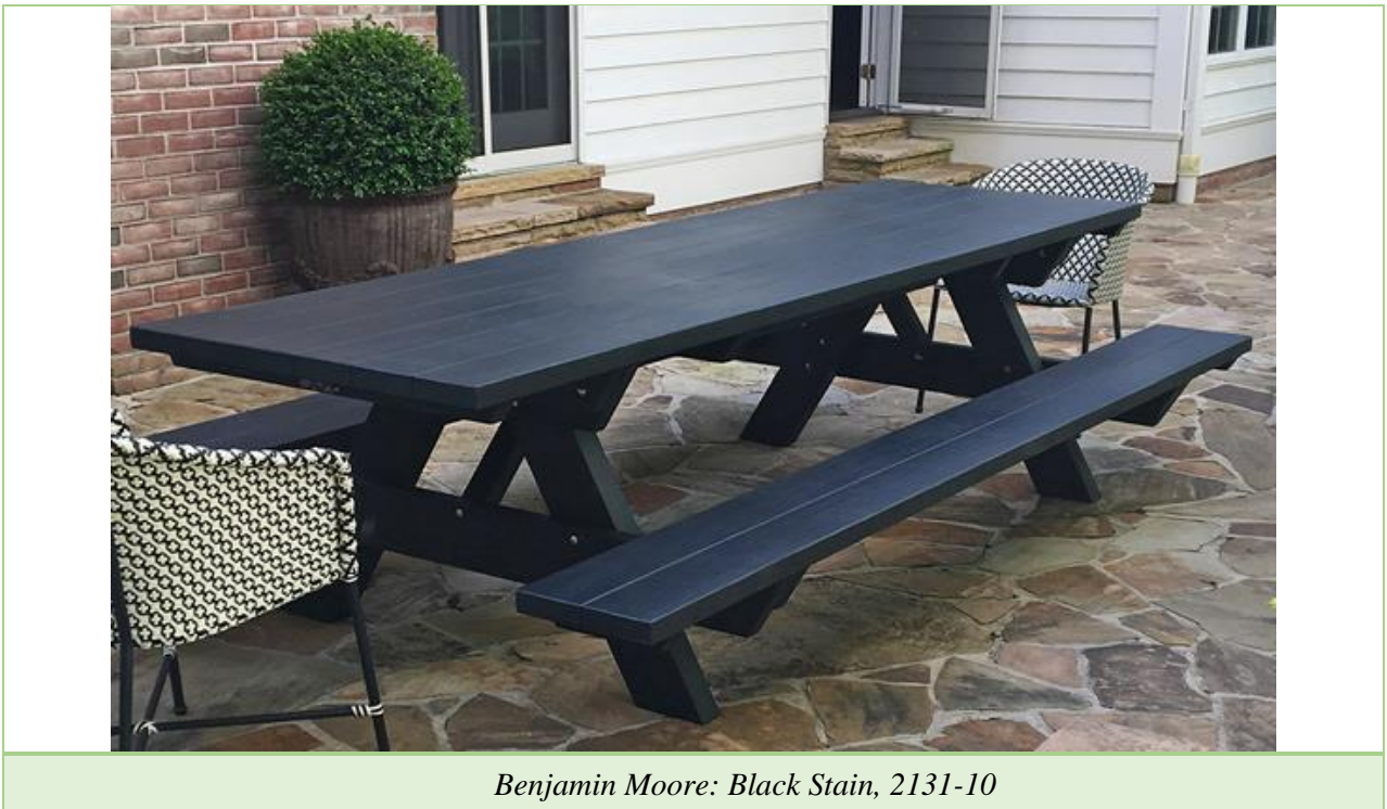
Benjamin Moore: Black Stain, 2131-10

Have Forever Redwood paint your order any color you like. We prefer to use Benjamin Moore paints because they make excellent quality products and offer a huge selection of paints and colors to choose from.