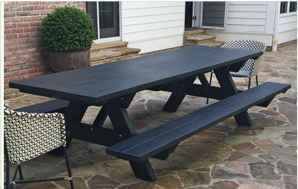
Benjamin Moore: Black Stain, 2131-10

Have Forever Redwood paint your order any color you like. We prefer to use Benjamin Moore paints because they make excellent quality products and offer a huge selection of paints and colors to choose from.